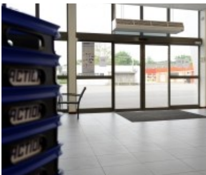
The over door air curtain is connected to a heat pump for maximum efficiency.

Action is committed to continuing the partnership. “Based on the positive results, Action has decided to extend its collaboration with Daikin.”