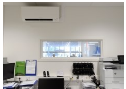
Discreet wall-mounted units offer year-round comfort.