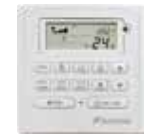
BRC51A62Y Wired Remote Control