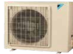
RR20 - 36AV1K RR20 - 30AV1KRE RR50AY1K